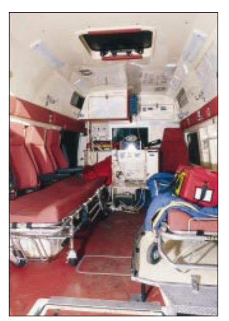
Comfort and safety of patients and staff are important

In addition to the vehicle's crew, a critically ill patient should be accompanied by a minimum of two attendants. One should be an experienced doctor competent in resuscitation, airway care, ventilation, and other organ support. The doctor, usually an anaesthetist, should ideally have training in intensive care, have