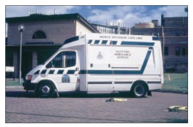
Specially equipped ambulances are best for transferring patients