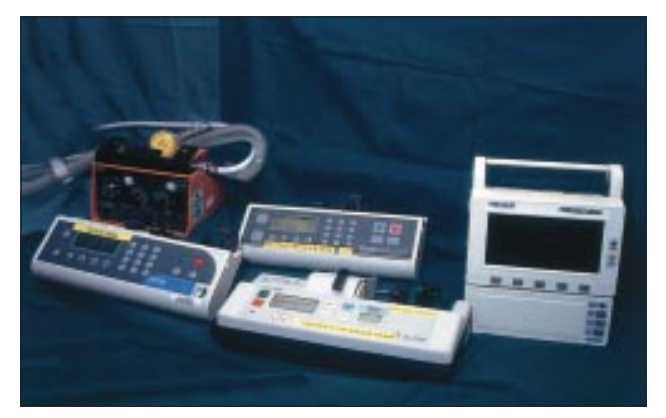
Portable ventilator, battery powered syringe pumps, and monitor