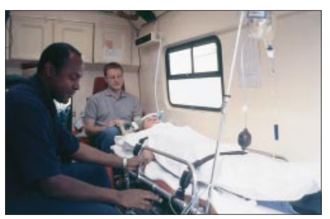
Patients should be accompanied by an experienced doctor and another trained member of staff

Care should be maintained at the same level as in the intensive care unit, accepting that in transit it is almost impossible to