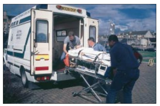
Trolley with shelf for equipment makes moving patients easier and safer